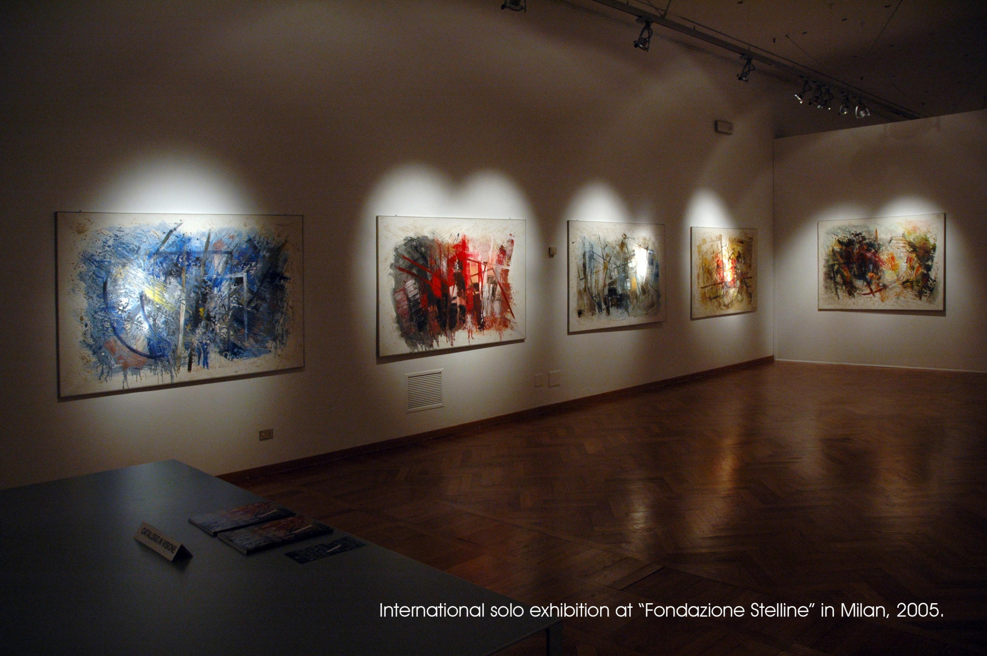
International solo exhibition at "Fondazione Stelline" in Milan, 2005.