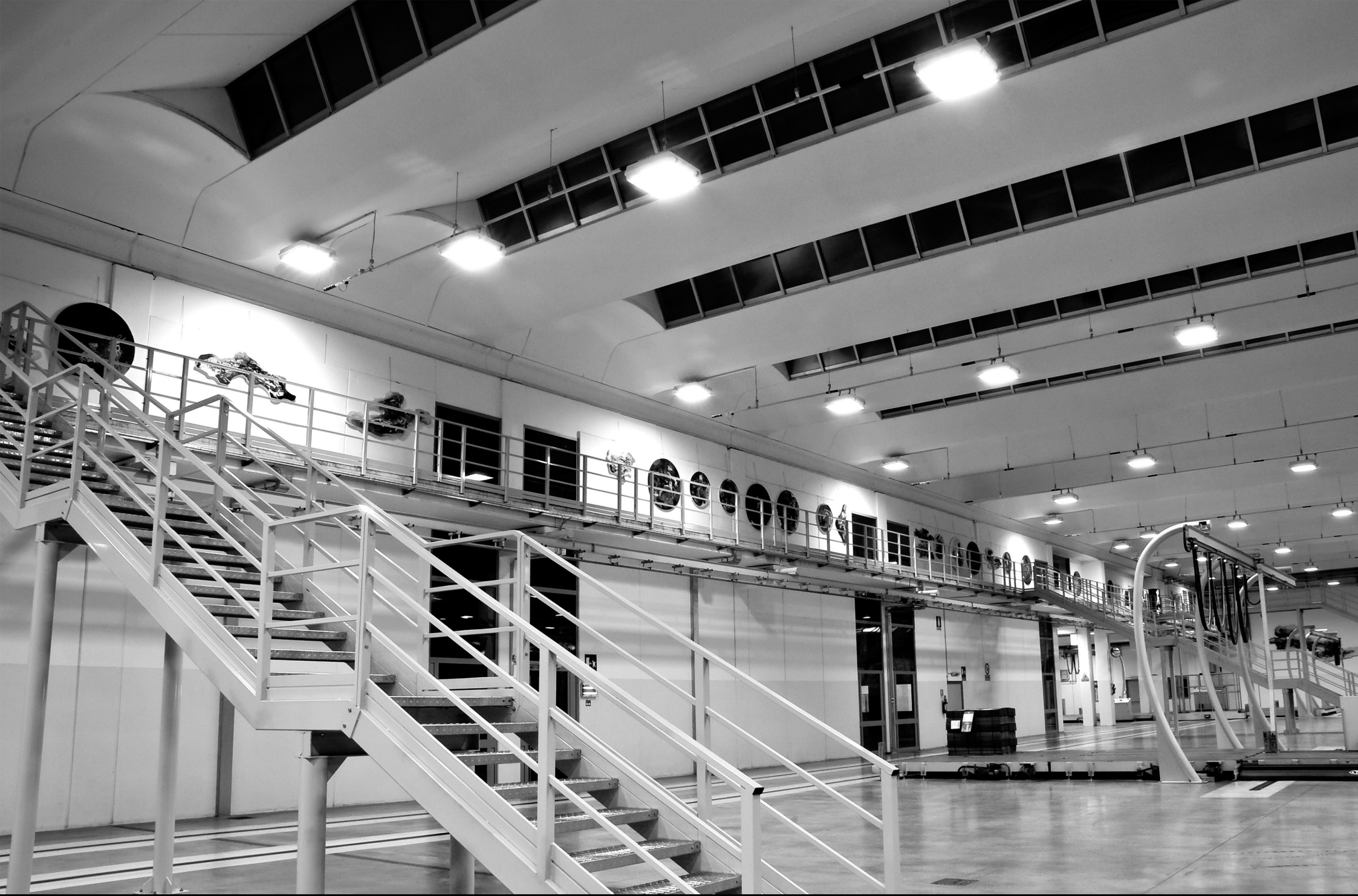
Private collection by major manufacturing facility, Parma