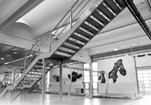
Private collection by major manufacturing facility, Parma