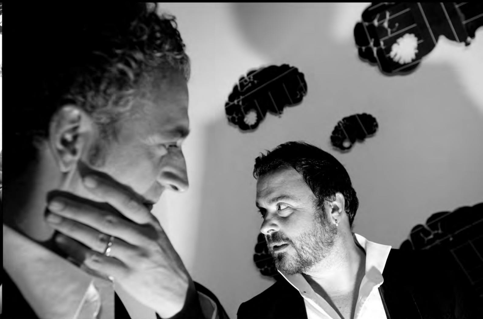
MILANO Glauco Cavaciuti Gallery, October 2010