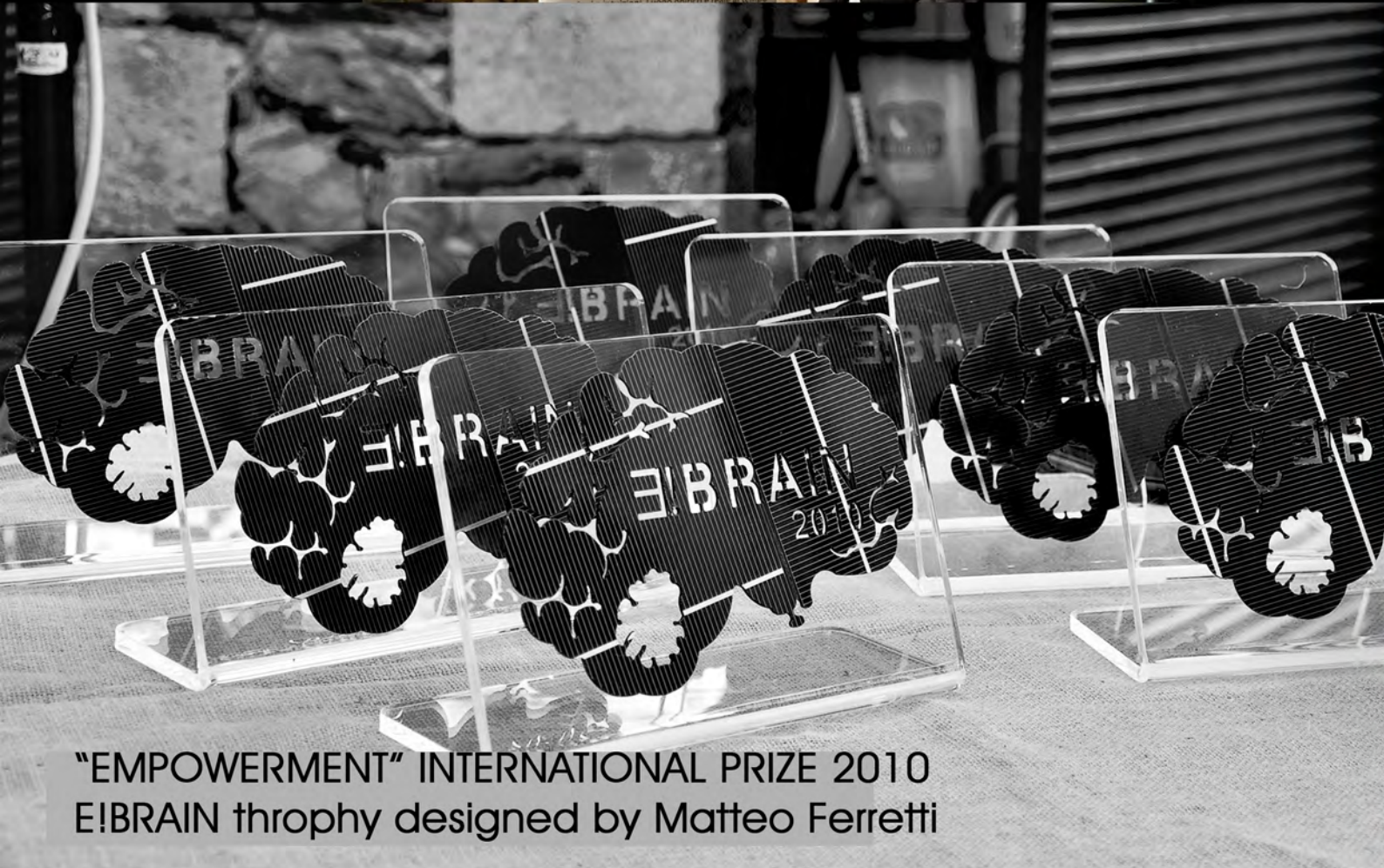
"EMPOWERMENT" INTERNATIONAL PRIZE 2010 E!BRAIN trophy designed by Matteo Ferretti